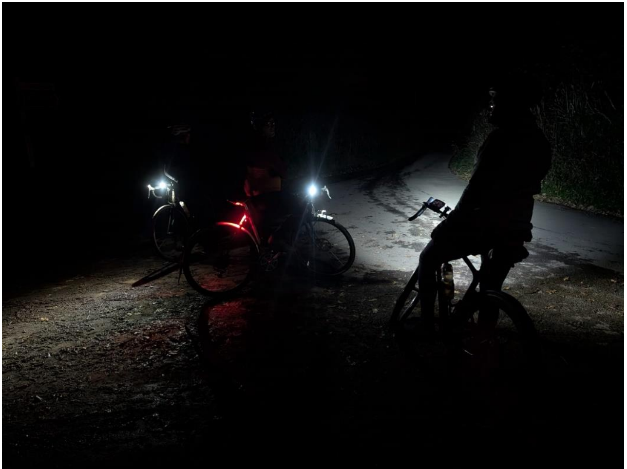
An atmospheric photo from the same ride.

Brrrrr. Interesting to see from this photo how good modern reflective hi-vis is, and how less effective standard kit is, even with orange bits ! And if you are in black you may as well be wearing a Harry Potter Invisibility Cloak.